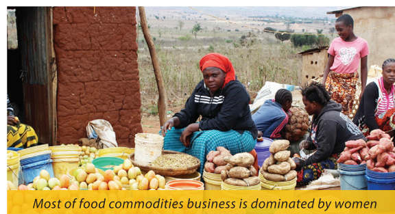
Most of food commodities business is dominated by women

ACT has established good relationship with the Media Community to realize cooperation. It utilizes a wide range of media tools to create awareness about policy issues. The major tools include: ACT Newsletter, fliers, newspapers, television and radio, database, website and agricultural shows.