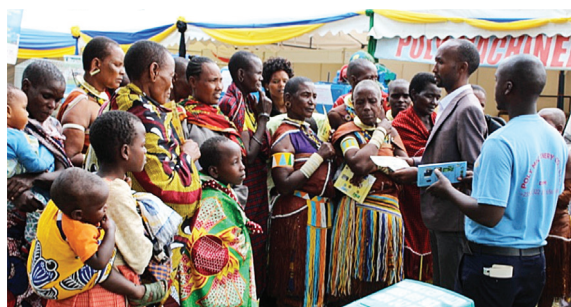
ACT organises exhibitions for stakeholders from a diverse background

ACT has set-up ICT tools to facilitate faster flow of information among actors. It is connected to several social media: Facebook, Twitter, YouTube, LinkedIn and Instagram. ACT has a special position in the Government. In 2017 it signed a MOU with the Ministry of Agriculture to make consultations regular.