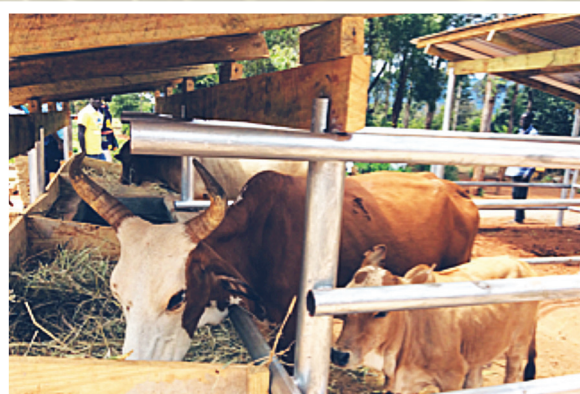
Livestock contributes significantly to the welfare of our communities

ACT is a member based organization. Members represent a broad spectrum of the agricultural private sector actors. By August 2021, the membership was 200, with individual members exceeding 4.5 million. Membership is in four categories: Full, Associate, Corporate and Honorary.